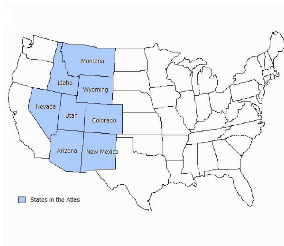
Figure 1. Location of the interior portion of the Western Colonial Waterbird Survey (2009-2011) and Atlas of Breeding Colonial Waterbirds in the Interior Western United States .